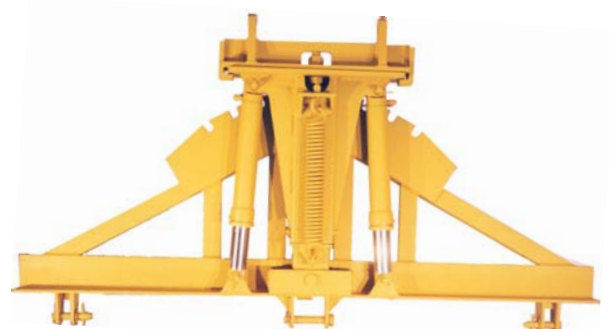
Viking Metropolitan One Way Plows