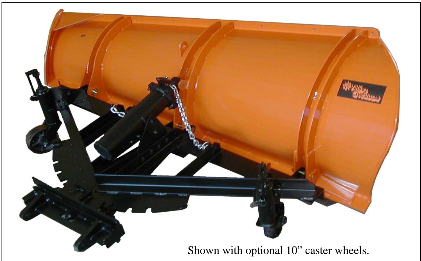
Shown with optional 10" caster wheels.